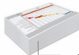
7,700 Sheets on-line